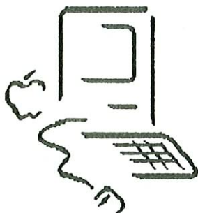
Macintosh Self Portrait