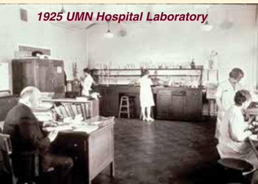
1925 UMN Hospital Laboratory