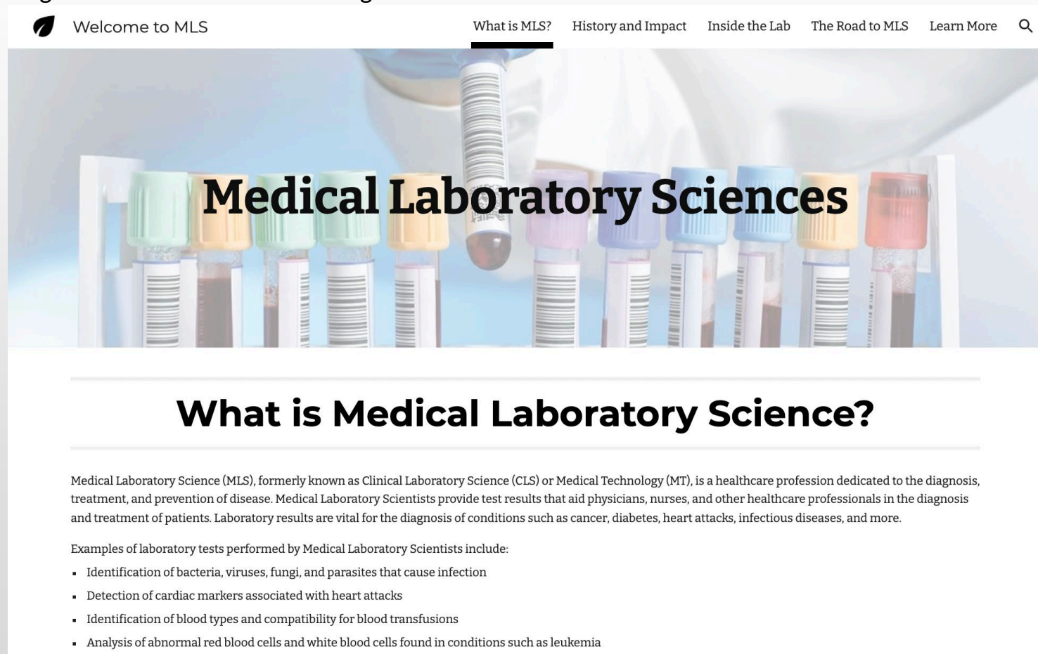
Figure 5: MLS Website Home Page