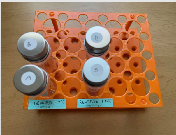
Figure 3: Activity Design (Test Tube Rack)