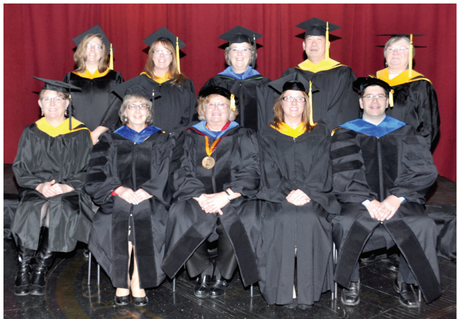
Faculty of the Medical Laboratory Sciences Program