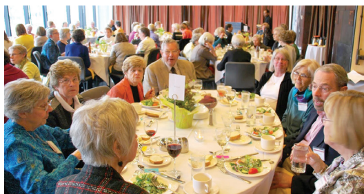
Members of the Class of 1963 and friends at the 2013 Alumni Banquet