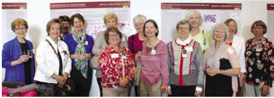
Members of the 50th Anniversary Class of 1969.